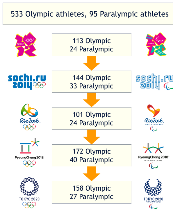
Figure 1. Number of Olympic and Paralympic candidate athletes included in the monitoring programme, overall and for each games cycle: London 2012, Sochi 2014, Rio 2016, PyeongChang 2018 and Tokyo 2020.