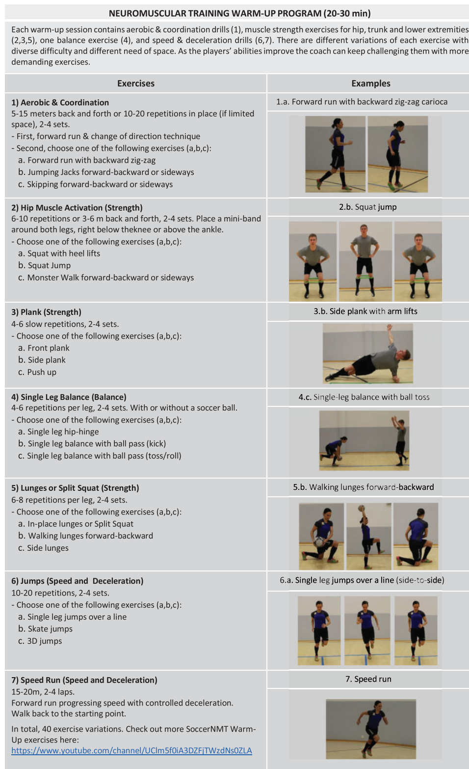
Appendix Figure A1. Neuromuscular training warm-up program.