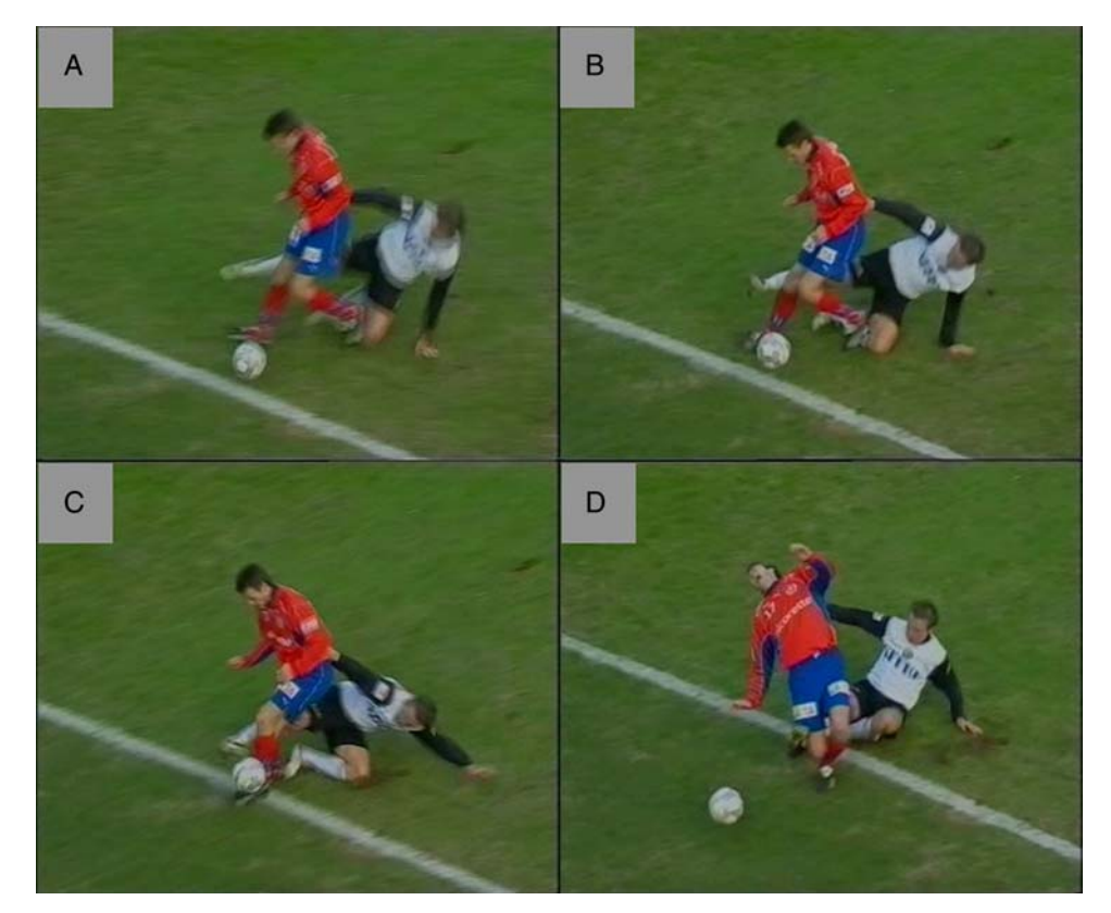
Figure 5 Direct contact mechanism (right knee). (A) At—60 ms, the player is jogging forward at slow speed towards the sideline trying to screen the ball from the opponent. (B) At initial contact, he strikes the pitch with his right heel and holds the trunk in a neutral position. (C) At 140 ms, having the entire load on his right leg, he is tackled from behind with forceful lateral impact to the knee joint. (D) At 440 ms, he falls backwards and his right knee clearly give way in substantial abduction (dynamic valgus collapse).

and suggests that knee valgus is also an important injury component in football. A sudden knee valgus increase was also reported in a non-contact ACL injury in a male professional football player, where the MBIM technique was employed.<sup>31</sup>