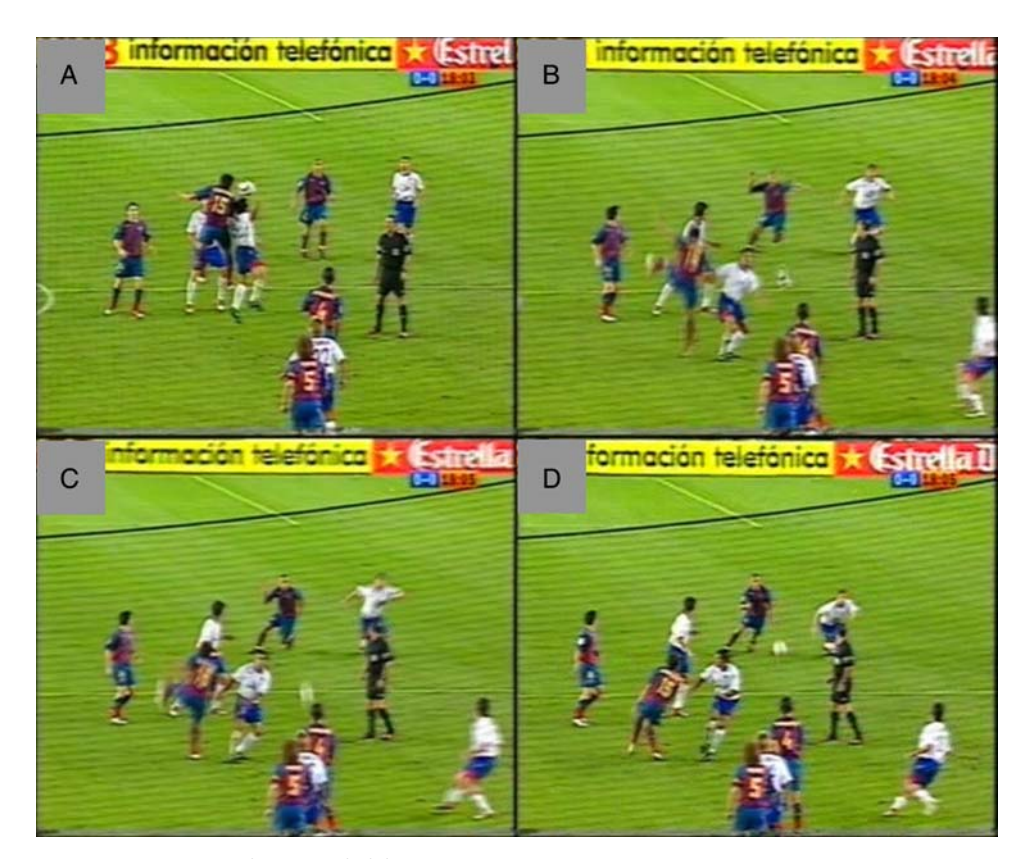
Figure 4 Non-contact heading mechanism (right knee). (A) At—306 ms, the player wins a heading duel while having trunk-to trunk contact in the air with his opponent. (B) At initial contact, he lands at high vertical speed on his right leg striking the pitch with the forefoot. (C) At 80 ms, being out of balance both backwards and sideways, he puts the entire load on his right leg. (D) At 186 ms, his right knee joint clearly give way in substantial abduction (dynamic valgus collapse).

Although the classification of knee valgus was uncertain as determined by visual inspection in 11 cases in our study, we observed valgus in 15 of the 19 remaining cases. This finding is in line with previous research from several other sports, <sup>10–13</sup> <sup>29</sup>