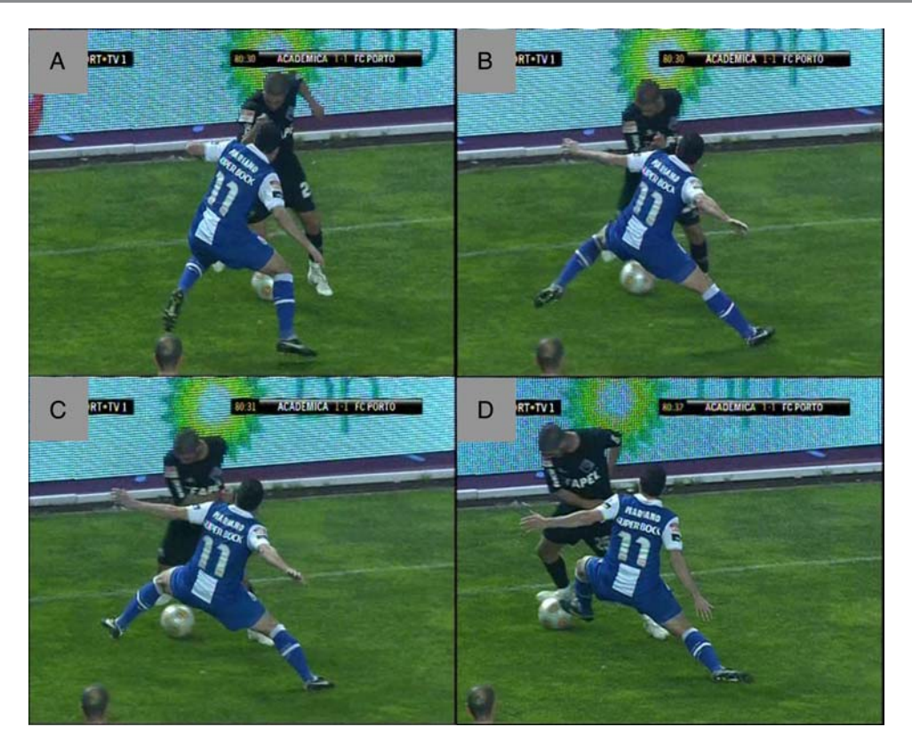
Figure 2 Non-contact pressing mechanism (right knee). (A) At—160 ms, the defending player is running forward at high speed towards the opponent in possession of the ball. (B) At initial contact, he strikes the pitch with his right heel and makes a sidestep cut in an effort to reach the ball or to tackle the opponent, but no player contact. (C) At 80 ms, he rotates the trunk towards his left leg and puts the entire load on his right leg. (D) At 240 ms the right hip and knee joints are in abducted positions and the ankle joint is in eversion (dynamic valgus without collapse).

All injuries occurring during landing after having headed the ball (n=5) were the result of non-contact injury mechanisms (table 2). The injured players landed mainly on one leg only (table 3). In all one-legged landing situations, the injured player landed on his forefoot (figure 4 and online supplementary video 3). The individual flexion angles at IC was 10° or less in all estimated cases for the knee, but showed greater variation for the hip (see online supplementary table S3). The median flexion angles were 10° for the hip and 5° for the knee at IC (table 4). Substantial hip abduction was seen in one case and knee valgus was seen in two cases (one unsure), and both of these were dynamic valgus collapses. Estimates of ankle eversion showed no clear trend: one 'yes', one 'no' and two 'unsure'.