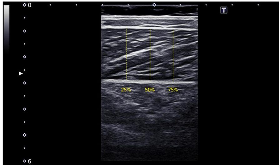
FIGURE 3 Ultrasound Scan of the medial part of the gastrocnemius muscle. Manual analysis of the muscle thickness at 25%, 50%, and 75% of field-of-view with ImageJ

flexion to full dorsal flexion). To ensure correct execution, all trainings were monitored by experienced sport scientists. Additionally, to the calf raises, core stability exercises (front-planks; side-planks; bridging) were performed to increase the subjects' compliance with the training intervention.