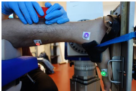
FIGURE 2 Image of measurement of the Achilles tendon stiffness

There is a strong structural and functional relationship between the muscle and tendon. Muscle thickness of the right medial part of the gastrocnemius muscle was, therefore,