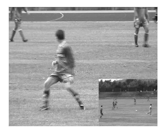
Figure 1. Snapshot of the synchronized individual close up- / general game events tapes.

situations were the ball is received from a teammate closer to own goal, defenders are excluded from the study.