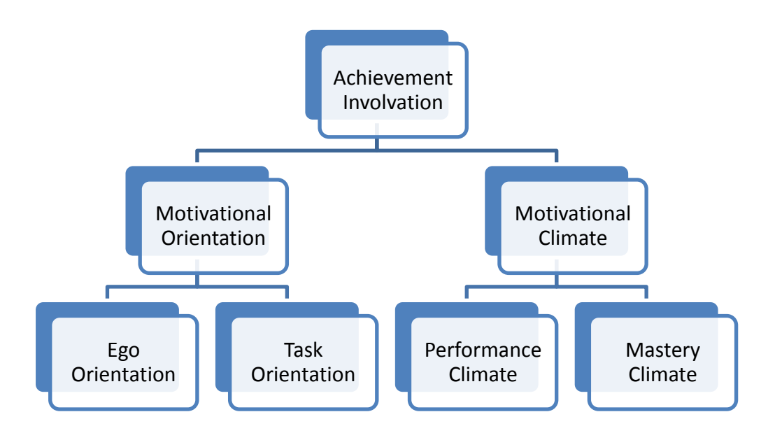
Figure 1. Model of achievement goal theory. Adapted from "Stress in Elite Sport: A motivational Perspective" (p. 14). by F.E. Abrahamsen, 2007, Oslo: Dissertation from the Norwegian School of Sport Sciences. Copywright 2007 by the Norwegian University of Sport and Scieces. Adapted with permission (Abrahamsen, 2007).

The individuals current state of involvement is influenced by the predisposed goal orientation (ego or task oriented), but also by environmental cues (performance or mastery climate) (figure 1). Environmental cues and the environment surrounding the individual were given the term motivational climate by Ames and Archer (Ames, 1992; Ames & Archer, 1988). The motivational climate is used to describe what type of goal involvement that is fostered in the achievement context. There are two types of motivational climates; a mastery involving climate and a performance involving climate. The mastery climate refers to a structure that supports learning and improvement of skills, effort, cooperation, and overcoming and mastering new challenges. A mastery climate is self-referenced, in that it focuses on improving one's personal best. Conversely, a performance involving climate promotes an ego involvement, and refers to a situation that foster public comparison between individuals, intra-team competition, and a punitive approach to poor or bad performances and awarding successful individuals.