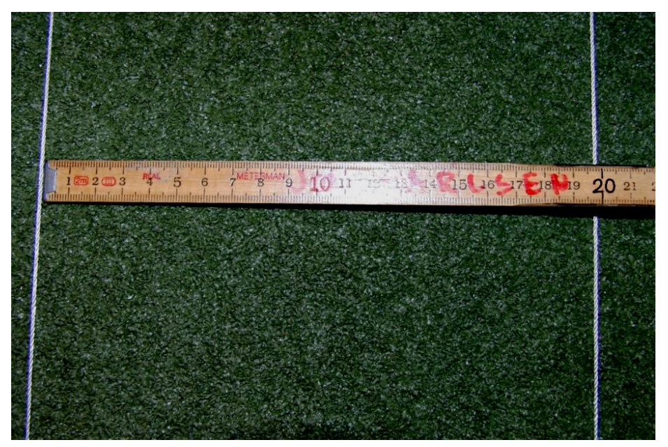
Figure 4. 20 cm between the two strings