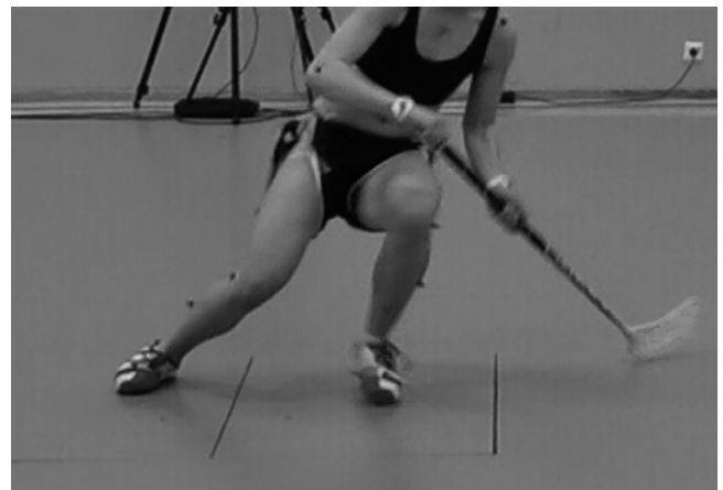
Figure 3. A floorball player performing the 180-degree pivot turn on the force plates.

synchronously at 300 and 1500 Hz, respectively. We conducted a static calibration trial before the test to determine the anatomic segment coordinate systems. Marker trajectories were identified using Vicon Nexus software. Both movement and ground-reaction force were filtered using a fourth-order Butterworth filter with cutoff frequencies of 15 Hz. 15 The contact phase was defined as the period when the unfiltered ground-reaction force exceeded 20 N.