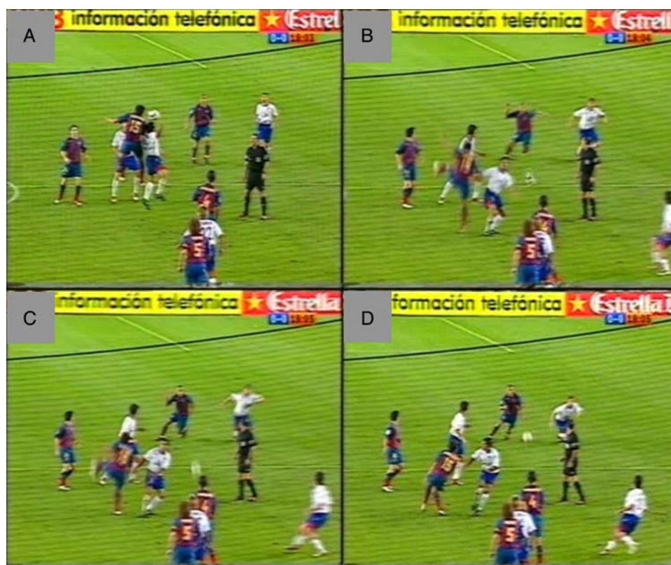
Figure 4 Non-contact heading mechanism (right knee). (A) At -306 ms, the player wins a heading duel while having trunk-to-trunk contact in the air with his opponent. (B) At initial contact, he lands at high vertical speed on his right leg striking the pitch with the forefoot. (C) At 80 ms, being out of balance both backwards and sideways, he puts the entire load on his right leg. (D) At 186 ms, his right knee joint clearly give way in substantial abduction (dynamic valgus collapse).

Although the classification of knee valgus was uncertain as determined by visual inspection in 11 cases in our study, we observed valgus in 15 of the 19 remaining cases. This finding is in line with previous research from several other sports, 10–13 29