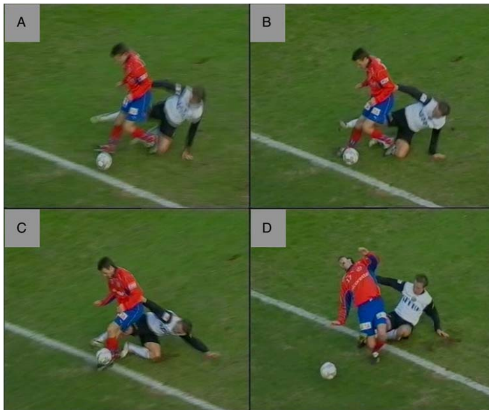
Figure 5 Direct contact mechanism (right knee). (A) At -60 ms, the player is jogging forward at slow speed towards the sideline trying to screen the ball from the opponent. (B) At initial contact, he strikes the pitch with his right heel and holds the trunk in a neutral position. (C) At 140 ms, having the entire load on his right leg, he is tackled from behind with forceful lateral impact to the knee joint. (D) At 440 ms, he falls backwards and his right knee clearly give way in substantial abduction (dynamic valgus collapse).

and suggests that knee valgus is also an important injury component in football. A sudden knee valgus increase was also reported in a non-contact ACL injury in a male professional football player, where the MBIM technique was employed. 31