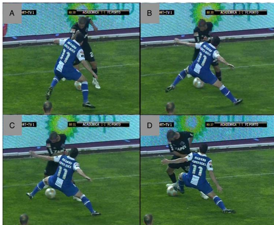
Figure 2 Non-contact pressing mechanism (right knee). (A) At -160 ms, the defending player is running forward at high speed towards the opponent in possession of the ball. (B) At initial contact, he strikes the pitch with his right heel and makes a sidestep cut in an effort to reach the ball or to tackle the opponent, but no player contact. (C) At 80 ms, he rotates the trunk towards his left leg and puts the entire load on his right leg. (D) At 240 ms the right hip and knee joints are in abducted positions and the ankle joint is in eversion (dynamic valgus without collapse).

All injuries occurring during landing after having headed the ball ( n=5 ) were the result of non-contact injury mechanisms (table 2). The injured players landed mainly on one leg only (table 3). In all one-legged landing situations, the injured player landed on his forefoot (figure 4 and online supplementary video 3). The individual flexion angles at IC was 10^\circ or less in all estimated cases for the knee, but showed greater variation for the hip (see online supplementary table S3). The median flexion angles were 10^\circ for the hip and 5^\circ for the knee at IC (table 4). Substantial hip abduction was seen in one case and knee valgus was seen in two cases (one unsure), and both of these were dynamic valgus collapses. Estimates of ankle eversion showed no clear trend: one ‘yes’, one ‘no’ and two ‘unsure’.