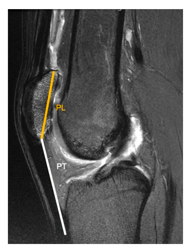
Fig. 3. Sagittal proton density-weighted fat-suppressed MRI shows assessment of Insall-Salvati ratio (ISR): patellar tendon (PT) / patellar length (PL).