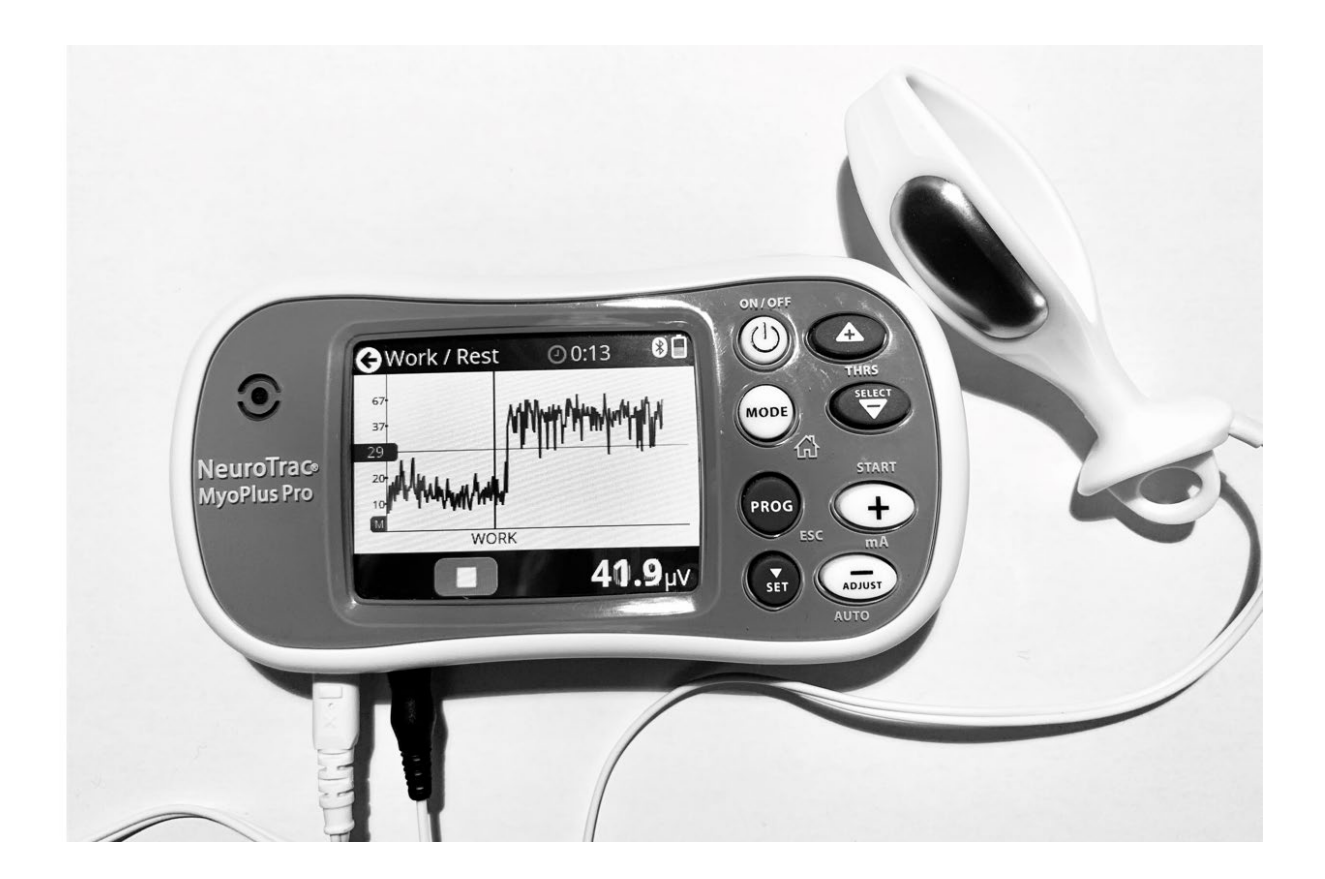
Figure 1 Surface EMG. NeuroTrac® MyoPlus Pro with Periform vaginal electrode (Quintet, Bergen, Norway).