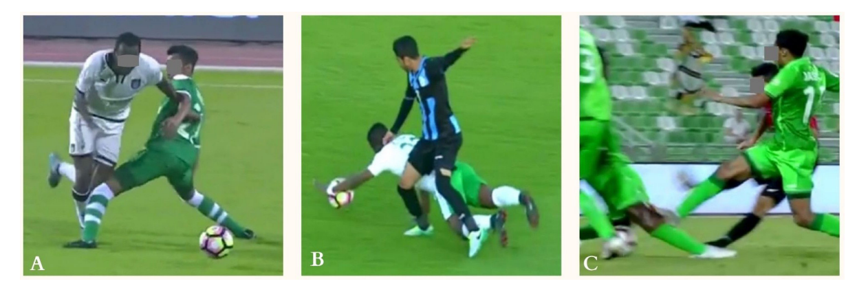
FIG. 6. injury situations in direct contact injuries. Injured knee in frame A (Left knee, green Jersey player), frame B (Right knee, blue and black jersey player) and frame C (Right knee, green jersey player).