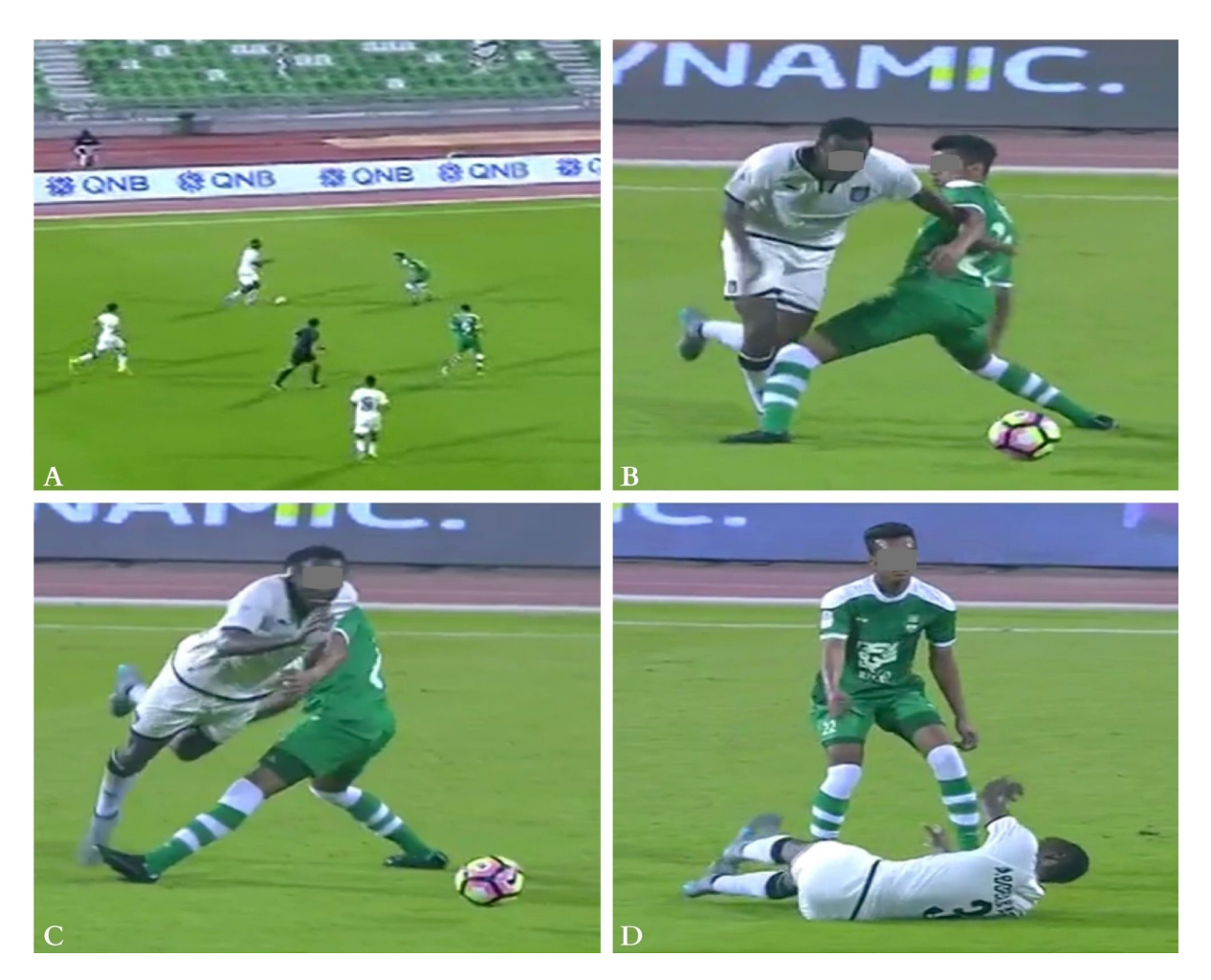
FIG. 5. Direct contact injury mechanism (tackling other player) to the left knee: The injured player (in green), in defensive situation, making short forward and backward steps waiting for the striker to come in front of him (Frame A). Then the injured player stretched his left leg (in a weightbearing position) to tackle the opponent. Both players' knees got in contact (frame B), causing a left knee compression mechanism in flexed position to the injured player. Following this contact, the injured knee went in extension (frame 3), the opponent fell down, the referee whistled a foul and the injured player continued to play (frame 4).