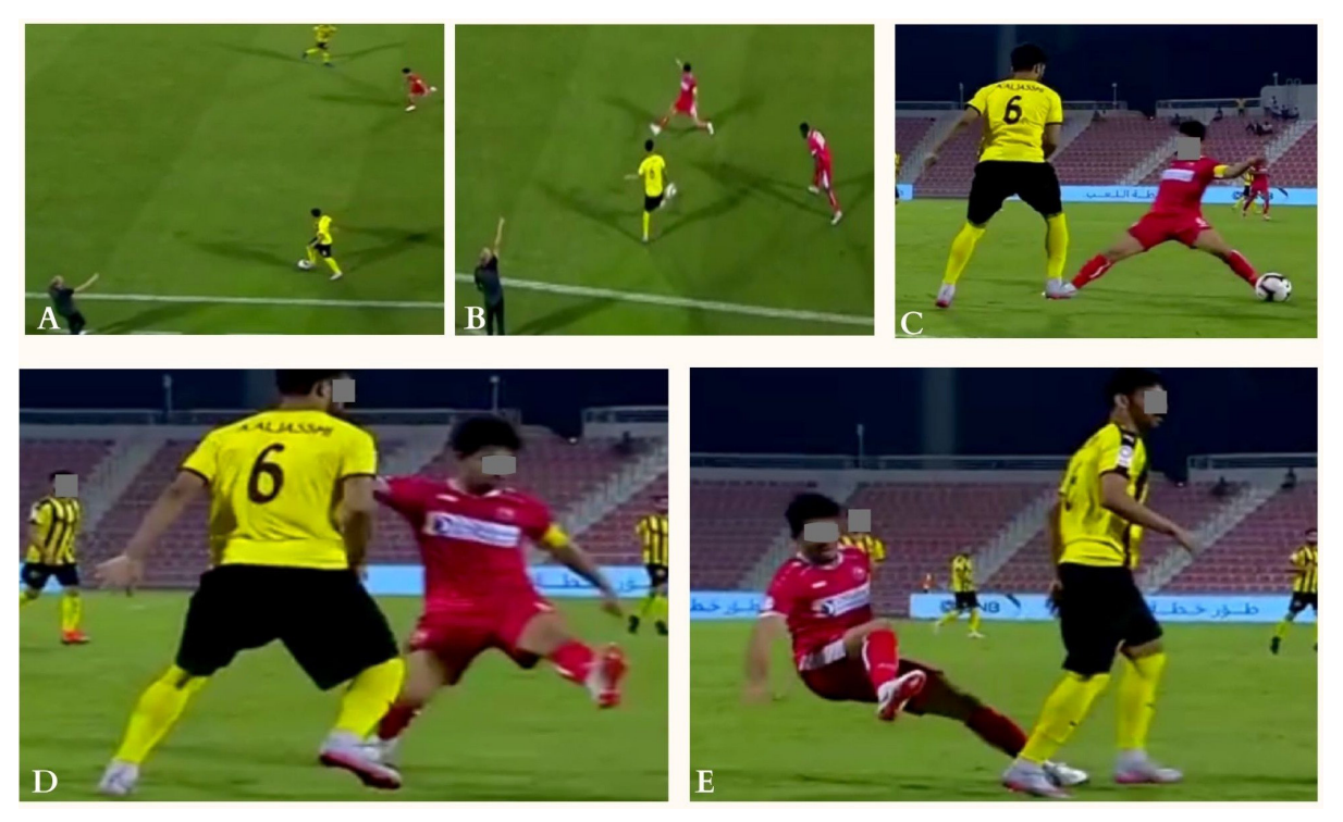
FIG. 3. Indirect contact injury mechanism (blocking) to the right knee: The injured player (in red) was running at high-speed trying to stop the ball from being passed to another player (frame A). Then he kicked the ball while his right foot was planted on the ground with a large hip abduction (frame B) causing a knee valgus and rotational motion (frame C). Then the player lost balance and fell down (frame D).