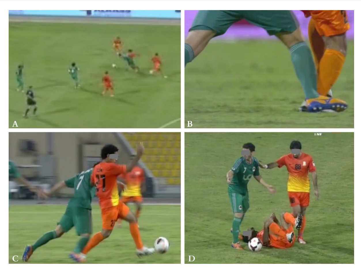
FIG. 2. Indirect contact injury mechanism (tackled by other player) to the right knee: the injured player (in orange), gained possession of the ball from an opponent (frame A). The second player immediately tackled him and stepped on his foot (frame B). The injured player continued running forward with his right foot blocked behind on the ground (Frame C). He lost balance and fell (frame D).