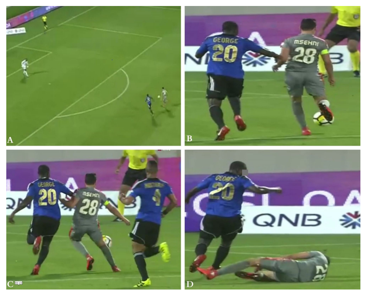
FIG. 4. Indirect contact injury mechanism (Screening) to the right knee: The injured player (in grey), in offensive situation, was running forward at high speed, with ball towards the goalkeeper, alongside the defender (frame A). He was screening/shielding to protect the ball while running. During arm/trunk contact (frame B and C), when loading on his right foot (frame C), the injured player had a right knee valgus stress with compression mechanism causing the injury that resulted in his fall on the pitch and immediate call for medical help (frame D).

5 and 6): 1. knee to knee contact involving anterolateral impact to the knee and leading to a knee compression mechanism in flexed position (58°); 2. body to knee contact with loss of balance, involving a postero-lateral impact to the knee and causing a knee valgus and an upper leg anterior translation; 3. foot to knee contact involving anterior impact and leading to knee hyper-extension. In the 3 cases, there was mainly a large hip abduction (2/3) with a flexed hip (39 to 48°). Foot rotation, foot strike and ankle eversion varied.